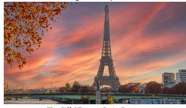
The Eiffel Tower - Paris, France