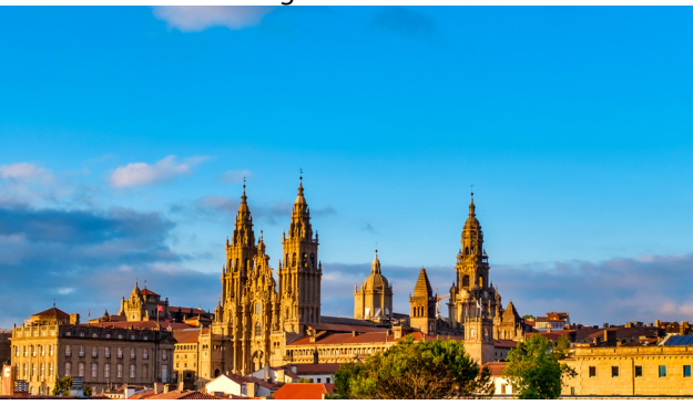
Santiago de Compostela