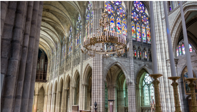
Basilica of St. Denis - Paris, France